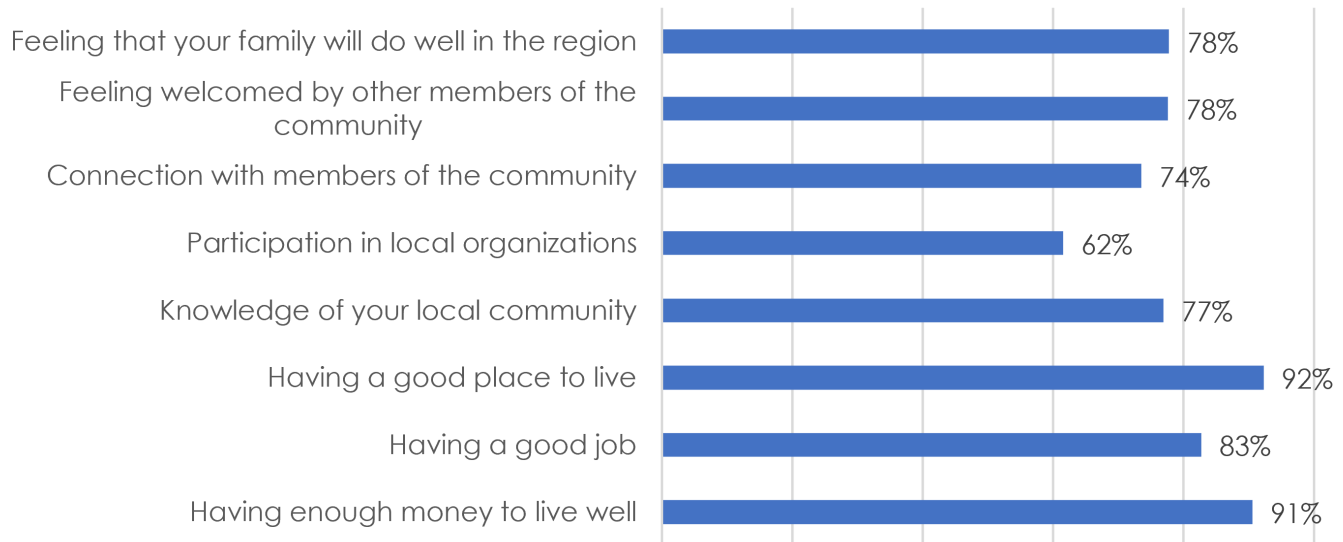
Figure 2: Importance of Welcoming Factors