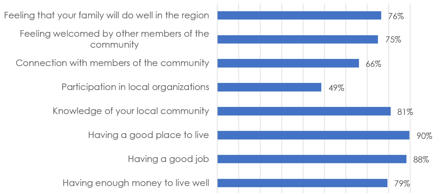
Figure 2: Importance of Welcoming Factors