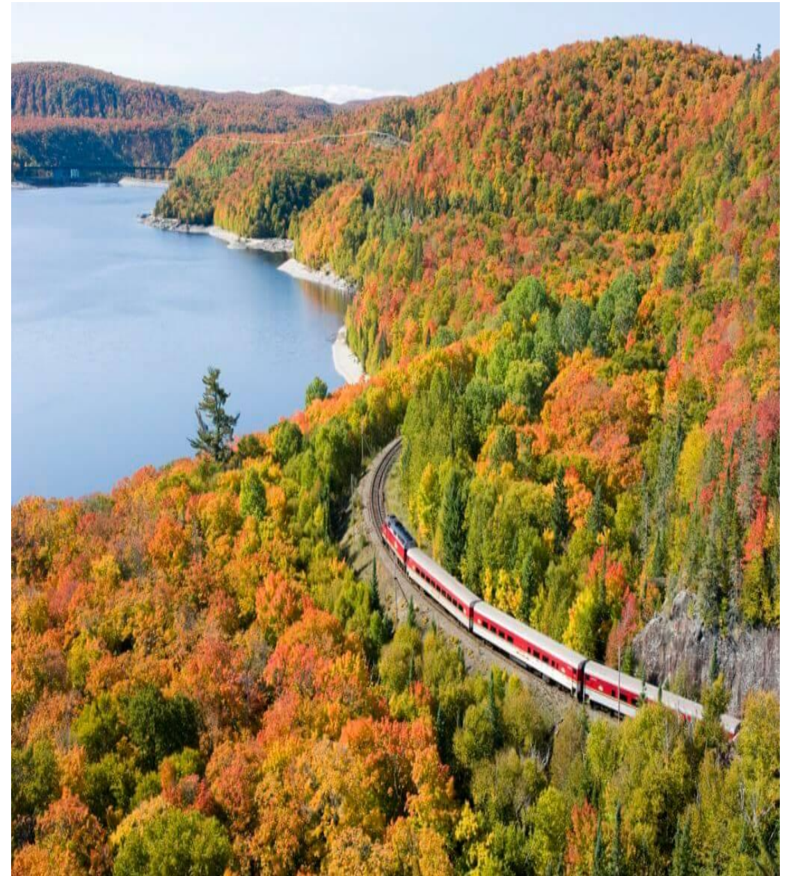
Image: lake superior circle tour