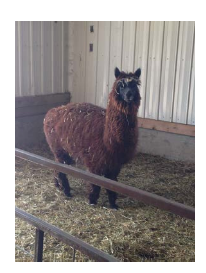
"Doug" - Egli's Sheep Farm, April 2015