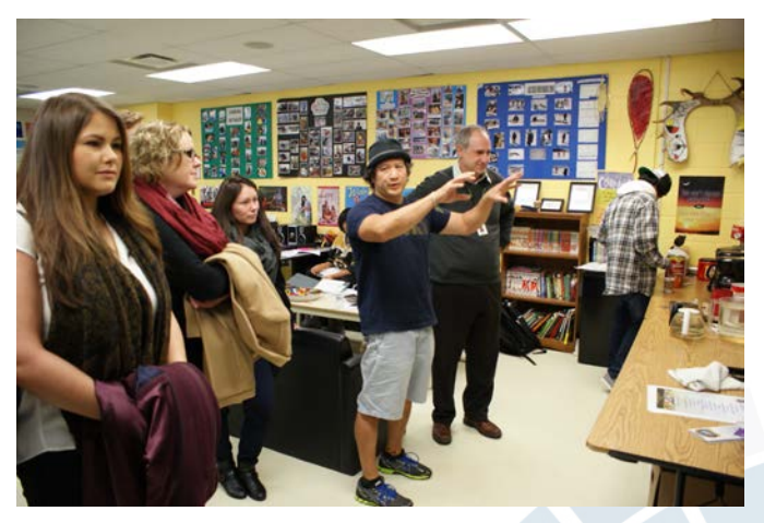
Northern Policy Institute staff visit Queen Elizabeth High, Sioux Lookout, 2014