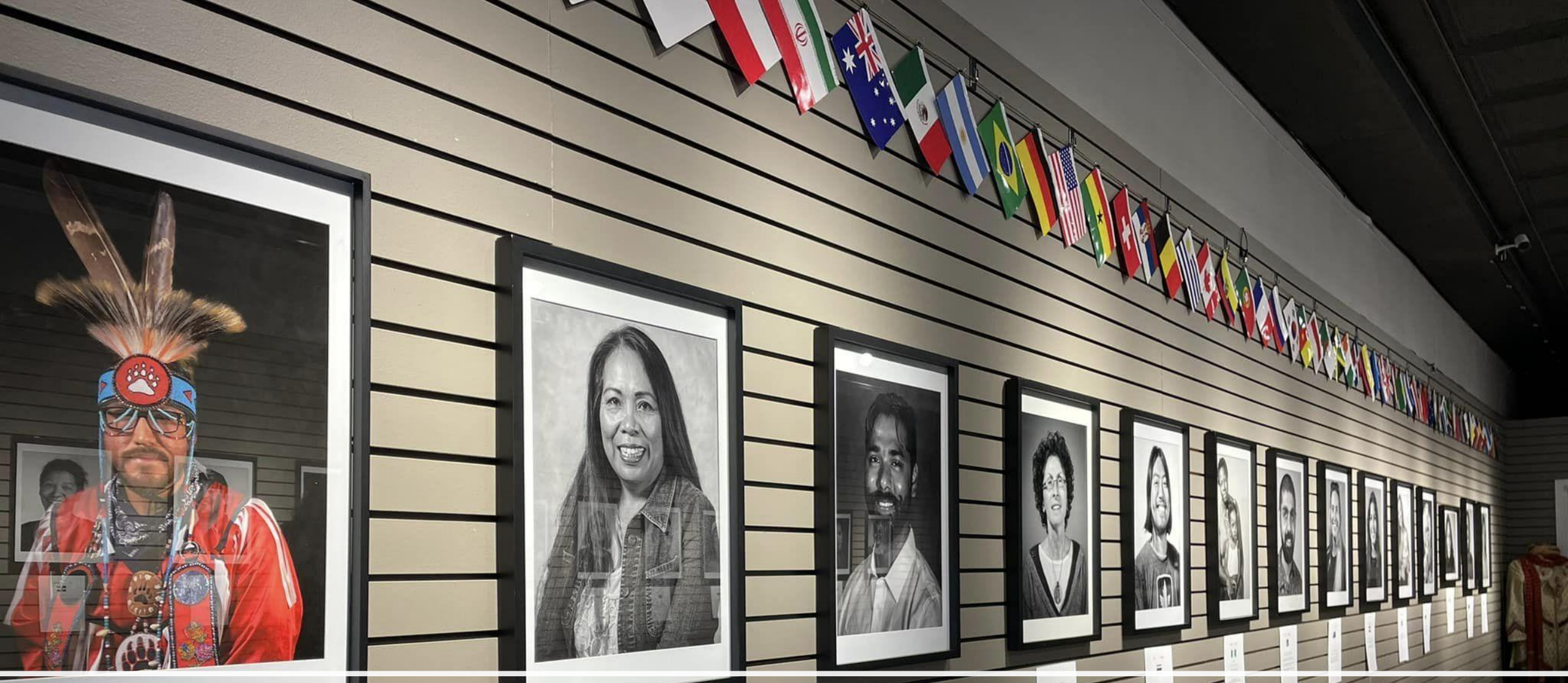
“Neighbors” - people in the area born outside of Canada