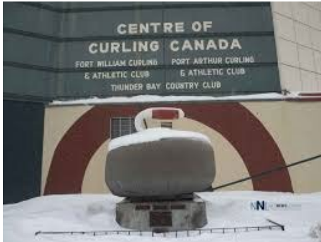
Curling Capital of Canada