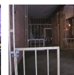
Turning around North Bay's downtown