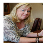
North Bay doctor opens the web door on personal health records